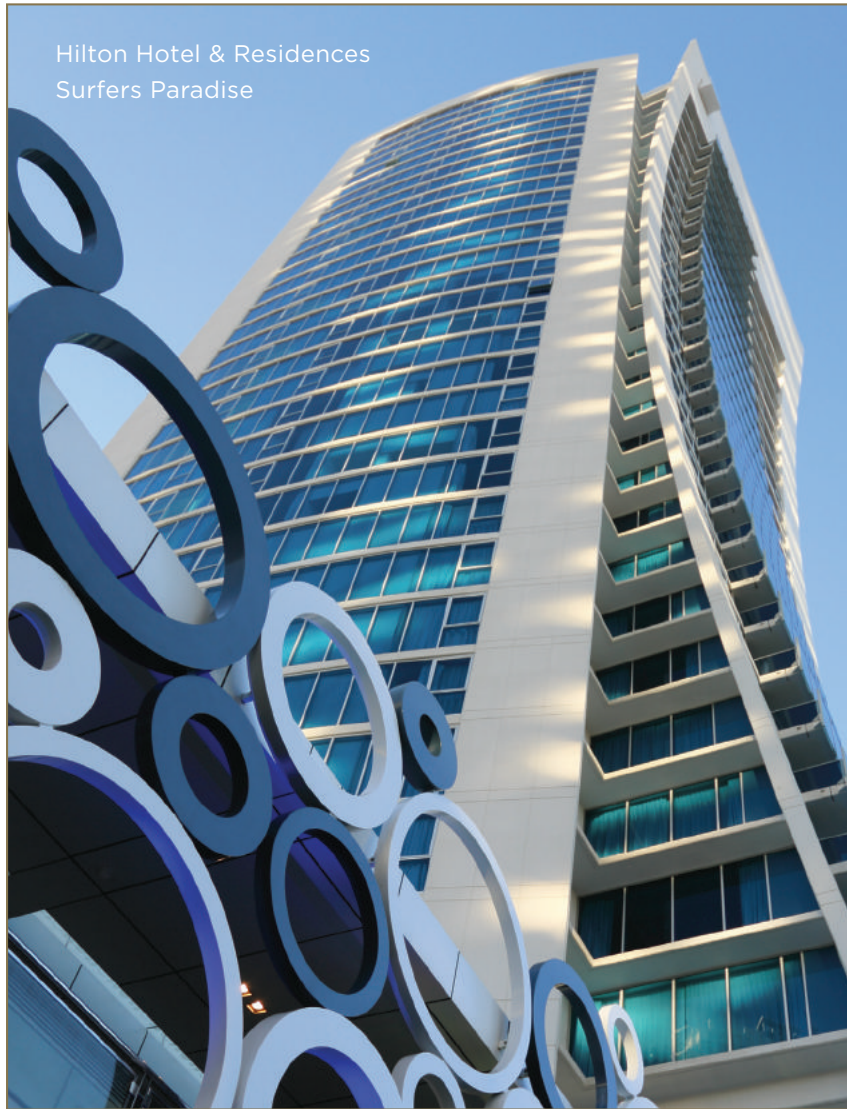
Hilton Hotel & Residences Surfers Paradise