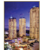
The Towers of Chevron Renaissance