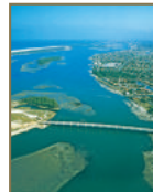
Ephraim Island Bridge