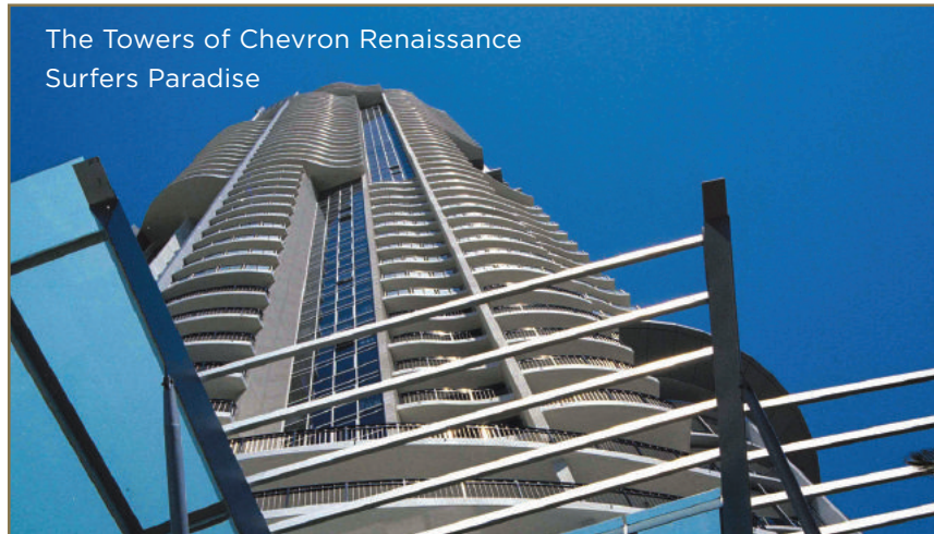
The Towers of Chevron Renaissance Surfers Paradise