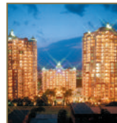
Bel Air Resort