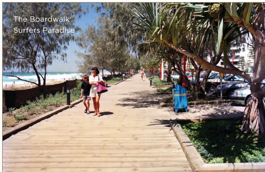
The Boardwalk Surfers Paradise