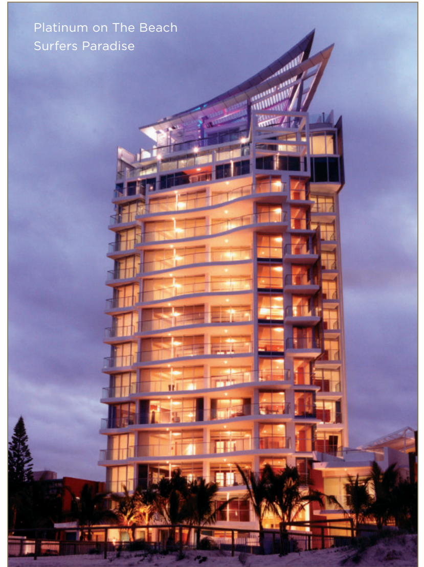
Platinum on The Beach Surfers Paradise